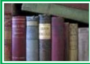
Time to turf those old medical books!

Our E-books are complete (full-text) electronic books that you can access from any computer connected to the Internet from anywhere in Alaska. Say goodbye to those sad-looking, dusty shelves of old outdated medical books in your staff lounge or office area that no-one looks at anymore. They are just too expensive to update anyway! Our